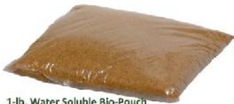
1-lb. Water Soluble Bio-Pouch

MicroClear® 108 is a high potency, bacteria-laden, powdered formulation for use in controlling algae and BOD through the competition of available nutrients in the water. This product is designed as a feed additive and water treatment product formulated to promote the production of healthy shrimp and fish. MicroClear® 108 contains a specially formulated, proprietary blend of microorganisms and surface tension suppressants/penetrants. Because of the diversity of the microorganisms enzyme systems, this product is excellent for increasing water clarity through controlling algae population, lowering BOD and TSS levels. MicroClear® 108 reduces harmful ammonia levels that can be toxic. The safe naturally occurring bacteria and enzyme systems are present in high numbers to handle difficult algae, BOD and odor related problems.