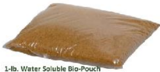
1-lb. Water Soluble Bio-Pouch