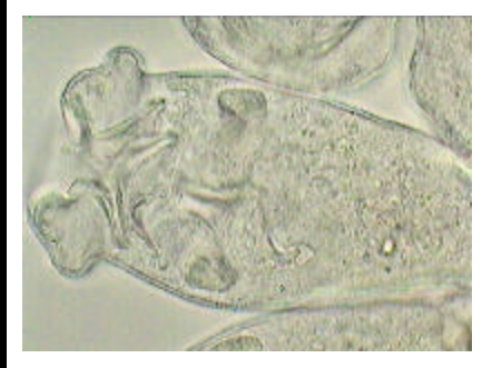
Check out our website for more photos of our new mystery bug!!!! WWW.EnvironmentalLeverage.com