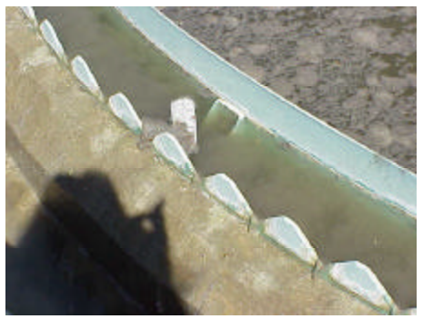
Temperature- At higher temperatures, the water is less dense, therefore, the higher the temperature, the more rapid the settling.

particles there are (within design), the better the settling.